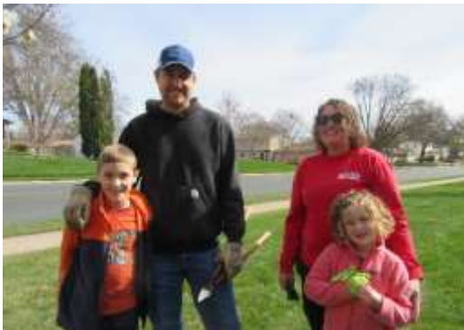
All four Hanseys worked all morning raking and cutting down overgrown bushes